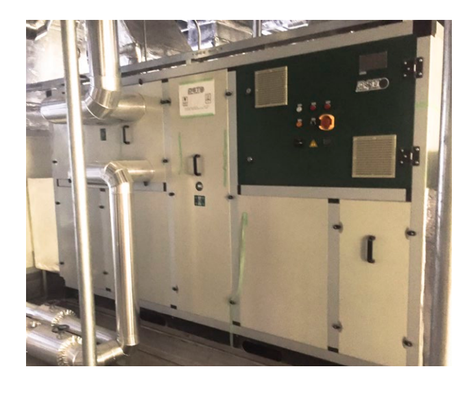
DST RFA-172 installed at Angel Yeast corporation

DST China's first contract with Angel Yeast consisted of two RFA-172 steam regenerating units, each pushing 20,000 m3/h of dry air into their new facilities. Which easily met their humidity control requirements with virtually zero maintenance needed during the first two years of operation.