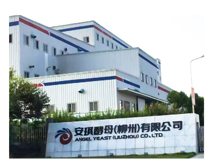
Angel Yeast Co., Ltd

Angel Yeast Corporation. Their anticipated output is projected at 20,000 tons annually, consisting primarily of high-active dry yeast. Which should all roll off of a production line controlled at absolute humidity of 2 g/kg. Angel Yeast engineers were primarily concerned with maintaining constant environmental stability, with emphasis on reliability of the machinery used to maintain that environment. The client had experienced excessive stoppages due to inadequate and poor quality machinery in the past and was keen to avoid repeating it and to get a more efficient production.