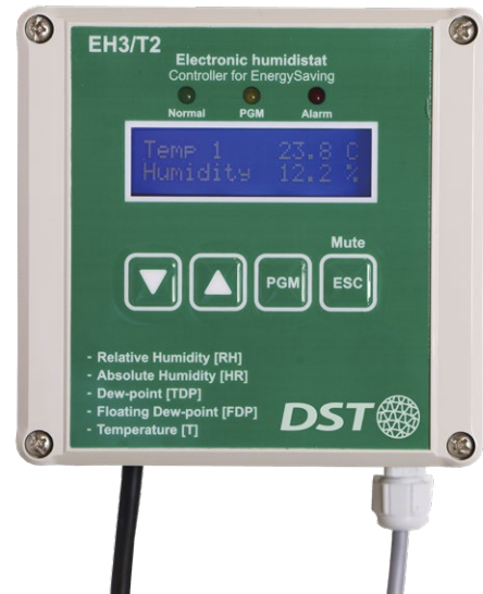
EH3 T2 with back-lit display, available from Seibu Giken DST only

Sensor: Capacitive type moisture sensor from Honeywell with an accuracy of <\pm 2\% RH and <\pm 0.5^\circ C. Each sensor comes with a calibration protocol.