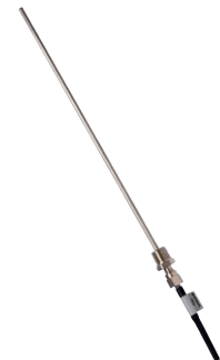
Temperature sensor 2 (optional), also available for surface mounting